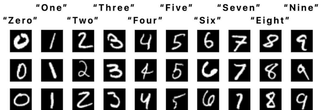
Handwritten digits alongside their trained model predictions.